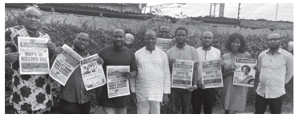
Echonews Publisher, 4th left in group photograph with the students

The former Lagos State Commissioner for Information and Strategy analysed the various functions of each of the five departments in the publishing firm and their interdependence as he also commended the sheer brilliance and doggedness of his