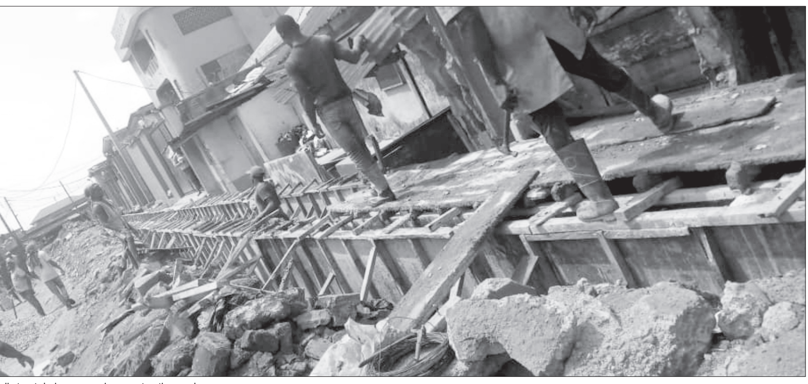
Raji street drainage ongoing construction work

Although the residents of the street are affected by the